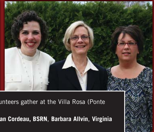
TOP: A group of TGIF organizing committee members and volunteers gather at the Villa Rosa (Ponte Club) for this year's event