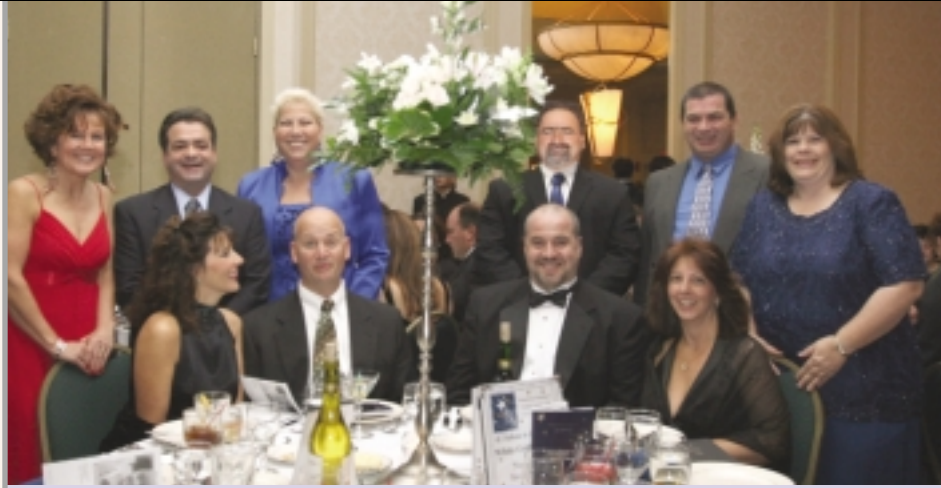
Representatives from White Gold Sponsor Naugatuck Savings Bank Foundation enjoying the Gala.

For further information regarding any of the above events, please contact the Fund Development Office at 203-573-7691.